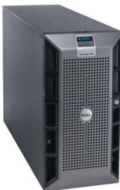
Dell PowerEdge 2900

The Dell PowerEdge 2900 server is equipped with a Baseboard Management Controller (BMC) that includes a complete set of tools that monitors server hardware, alerts you when server faults occur and enables basic remote operations. For environments with servers located in secure data centers or in sites with no IT staff, Dell offers an optional feature for PowerEdge servers, the Dell Remote Access Controller (DRAC). Operated through a Web-based graphic user interface, DRAC can enable remote access, monitoring, troubleshooting, repair and upgrades independent of the operating system status. Common software with the same family of PowerEdge 9th generation servers further helps simplify management. Plus, the Dell Behavioral Specification means one familiar platform for less complex deployment, management and serviceability as well as lower Total Cost of Ownership (TCO) over multiple generations of PowerEdge servers.